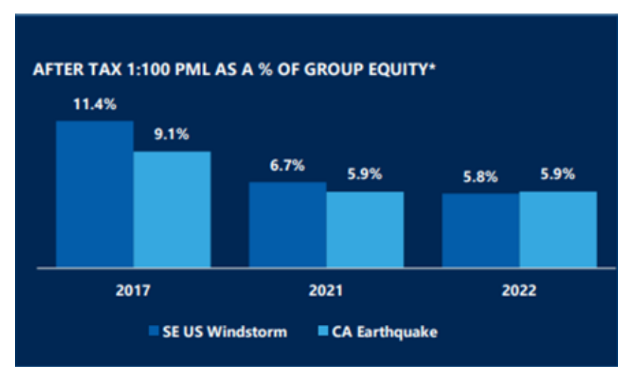
*For 2017 and 2021, calculated as the 1:100 PML net economic loss as of January 1, divided by Everest's shareholders' equity of the preceding December 31. For 2022, PML is a projected at 12/31/2022.

A chart displaying Everest's risk profile transformation and reduced exposure to natural catastrophe events in recent years is displayed below: